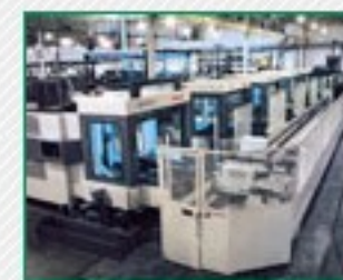
Straight line multilateral type FMS