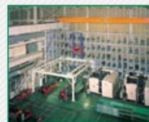
Solid multilateral type FMS