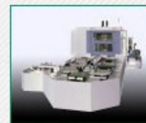
Multilateral APC type

FORMING A NEW WORLD High-Performance & Technology For Your Future Our "Technology", "Creativity", "Forward-Push" creates never-ending New-Value